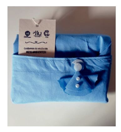
Figure 5: Result of ecobags made from SMS upcycling and how they reach patients.