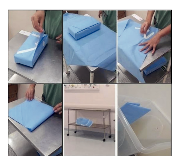
Image 2: Steps for safe SMS capture in operating rooms.

7- Daily transfer of plastic boxes for storage in exclusive stainless steel containers for this purpose.