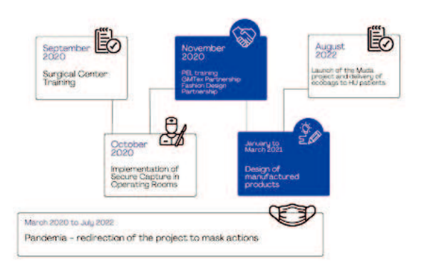
Image 1: Timeline of the study on secure capture and SMS upcycling.

After the safe capture of this period, the SMS blankets were packed and soon after, separated by size, according to the sizes of the blankets: 1.20m x 1.20m, 1.00m x 1.00m, 0.75m x 0.75m , 0.60m x 0.60m, 0.50m x 0.50m and 0.40m x 0.40m and other non-standard sizes, and later quantified in units and transformed into numeric data in kilograms (Kg), as shown in the line of time, illustrated below (image 1):