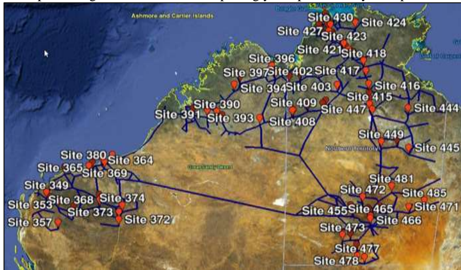
Figure 5 – Map showing the sites selected as spelling yards produced by the optimisation model

The cost of building a spelling yard is assumed to be $0.34M. The number of spelling yards varies from 55 to 82, as the results in Table 1 show. On one hand, for budgets larger than the amount needed to build 82 spelling yards, the model does not produce more than the 82 sites shown in Figure 4.