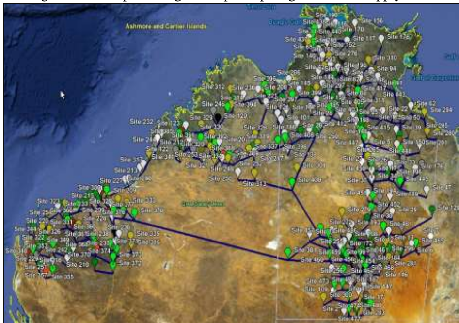
Figure 3 – A map showing all the participating sites in the supply chain

The sites in the Northern Territory are located along the Stuart Highway and cover the state from north to south, encompassing from the Top End to the regions of Katherine, Barkly and Central Australia. This network contains 486 sites, of which 84 are properties, 239 are fattening properties (226 agistment farms and 13 feedlots), 133 are candidate rest sites, eight are junctions, and 22 are terminal nodes (abattoirs, ports and saleyards). Figure 3 shows the location of the terminal nodes towards which all truckloads of cattle are sent.