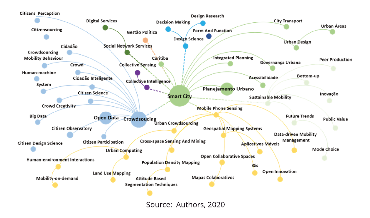
Figure 1: Influence between the themes in relation to the incidence in the periodicals.

The keyword that had the highest incidence in the articles was the smart city, with a total of seven times, followed by crowdsourcing, five times, and urban planning and open data with a total of two times. The other keywords were identified only once in the review. It is also noticeable that the articles related to design are still poorly articulated, demonstrating the importance of further studying the subject.